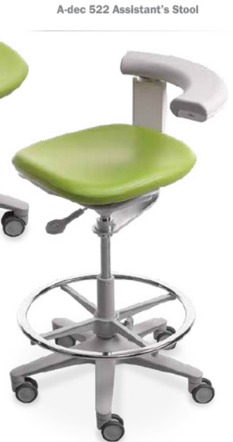
A-dec 522 Assistant's Stool