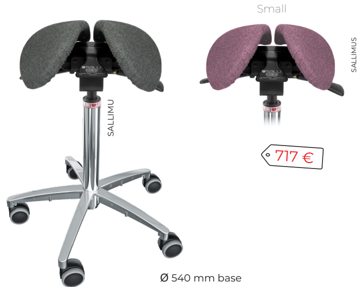
Ø 540 mm base