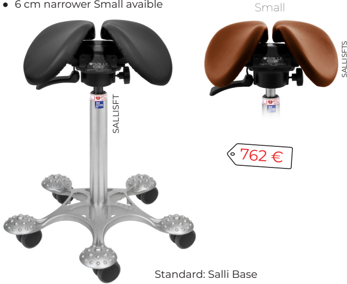
Standard: Salli Base