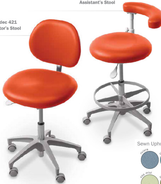
A-dec 421 Doctor's Stool

Select sewn or formed upholstery in an extensive color palette that's sure to complement your office. Make your next seating investment with A-dec—we're here to support you.