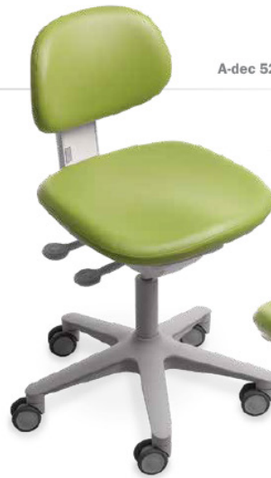
A-dec 521 Doctor's Stool

Backrest Height Control A push button makes access and one handed adjustments easy.