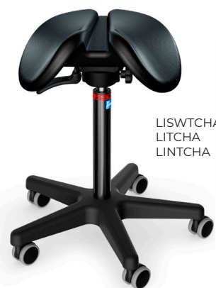
LISWCHA LITCHA LINTCHA