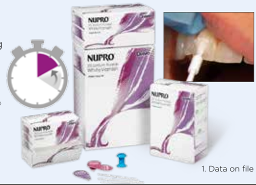
1. Data on file

NUPRO White Varnish is formulated with a hydrogenated resin and urethane resin comprising 5% sodium fluoride at 22600 ppm. An independent test also showed that NUPRO White Varnish had greater fluoride uptake vs. Colgate® Duraphat® Varnish and in the case of VOCO Profluorid® Varnish, up to 130% more fluoride uptake into lesioned enamel 1 .