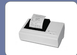
Printer for Melag Autoclave €295 Now only €148