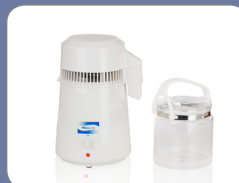
Melag Water Distiller €395 Now only €195