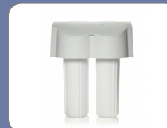
Melag Water Treatment System €395 Now only €195